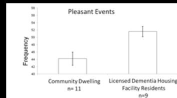
Figure 1. Mean number ( \pm SEM) of pleasant events experienced by community dwelling and Licensed Dementia Housing Facility (LDHF) residents. Pleasant events were measured by the Pleasant Events Schedule. Residents of the LDHF reported higher frequencies of pleasant events, t_{(19)} = -3.107 , p < .05 .